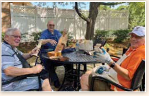
Wood carvers at work!