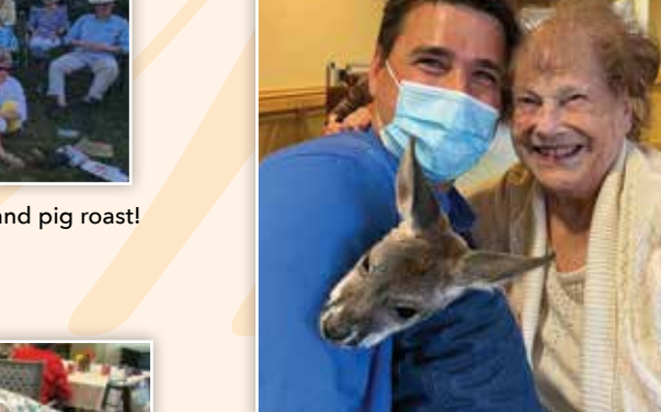
Care neighborhoods experienced a sweet visit from Aldinger Farms' baby kangaroos!