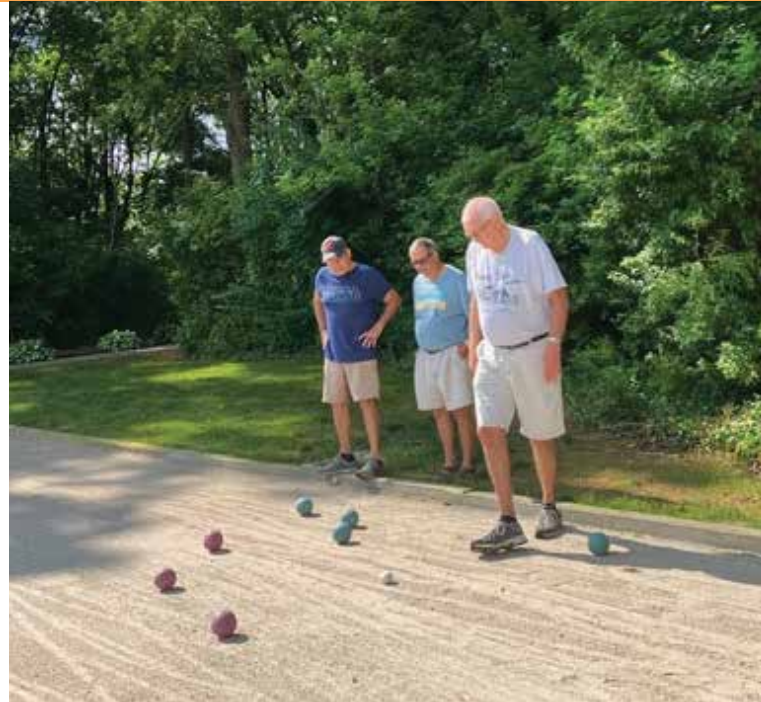
Meanwhile out in the bocce court, players are busy trying to determine who won the round!

In the fall, the Webers host a similar event, where the same group processes apples together. Their Applesauce Day will be held on October 12. If you show up to take a look, their enthusiasm might rub off on you to start your own food processing party!