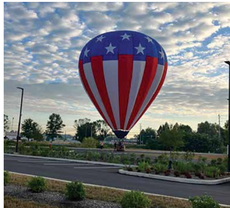
Floating with the wind, these hot air balloon riders got a great birds-eye view of our Woodlands Campus, and then liked it so much, they landed in our parking lot!